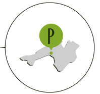
PROSECCO DOCG ZONE